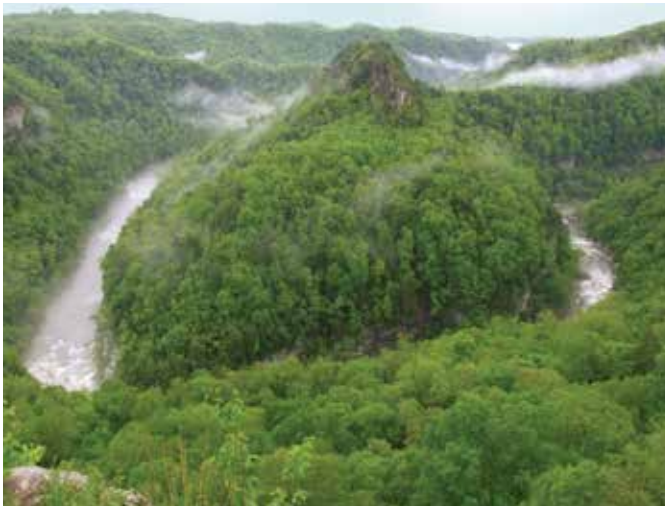
Breaks Interstate Park | Scenic Virginia