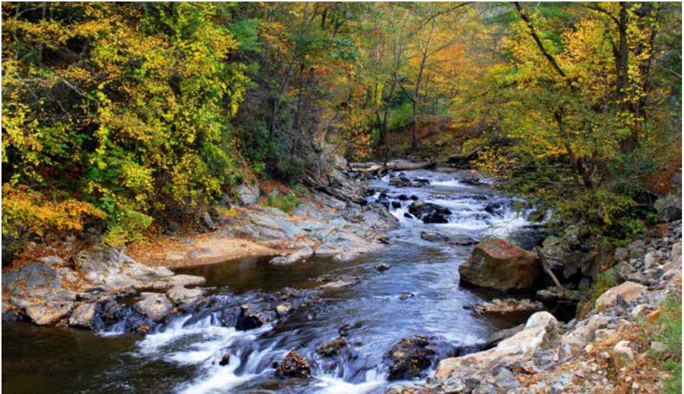
White water | Virginia Department of Conservation and Recreation